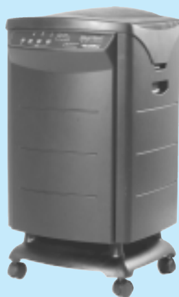
Bio-Net Air Purifier with EGF™